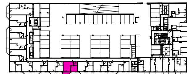
schéma pôdorysu 3. NP / scheme of the third floor